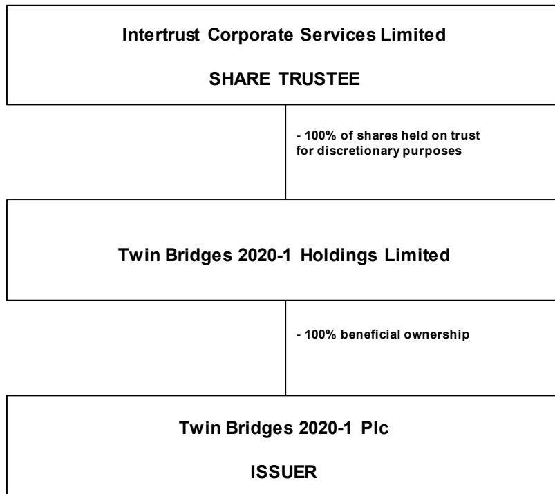
Figure 3 illustrates the ownership structure of the special purpose companies that are parties to the Transaction Documents, as follows: