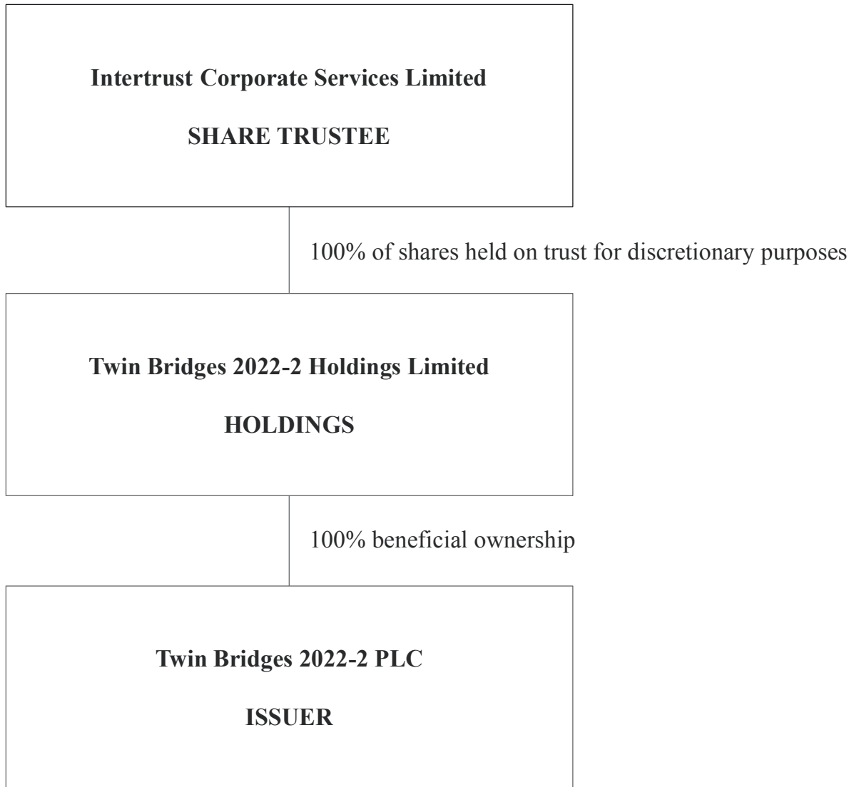
Figure 3 illustrates the ownership structure of the special purpose companies that are parties to the Transaction Documents, as follows: